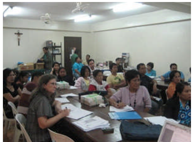
Wow! Very attentive librarians

Congratulations to PTLA. ForATL wishes you a good luck for your future endeavours.