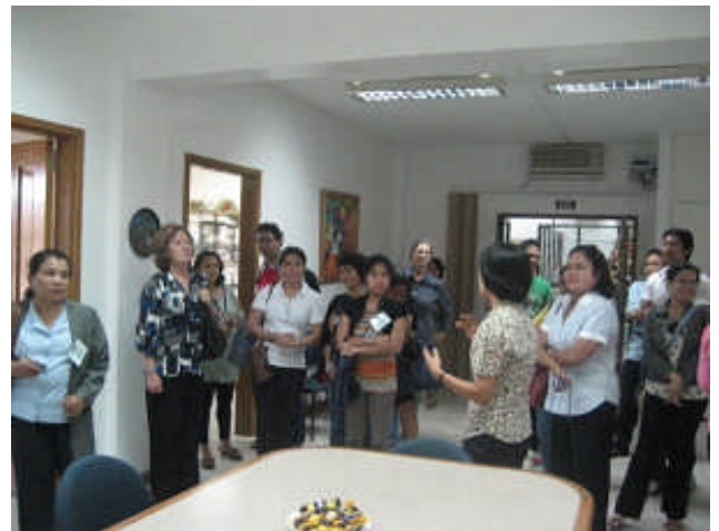
Tour at Adventist International Asian School Library