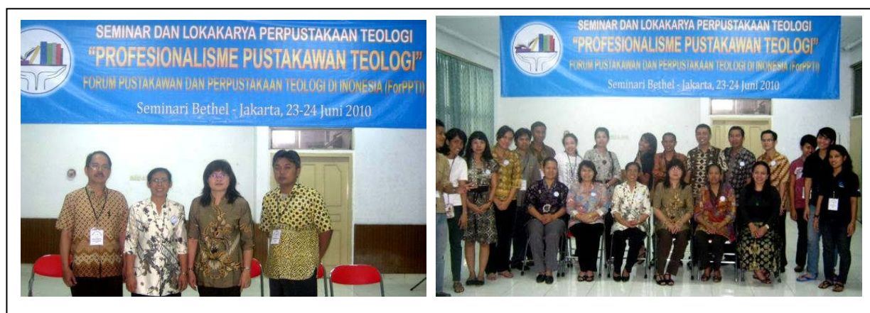
Executive Committee 2010-2014