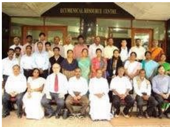
Participants of Silver Jubilee celebrations of Joint Library Committee held on 18-Nov-2010