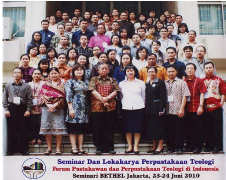
Participants of workshop for theological librarians of Indonesia