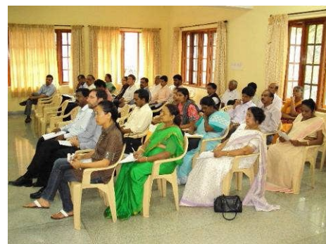
JLC Silver Jubilee celebrations