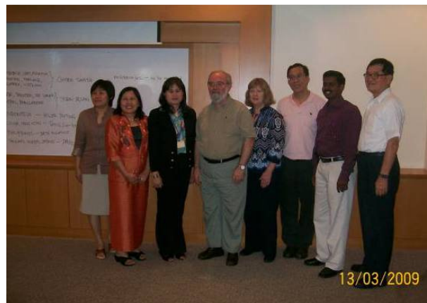
ExeCom with International Representatives