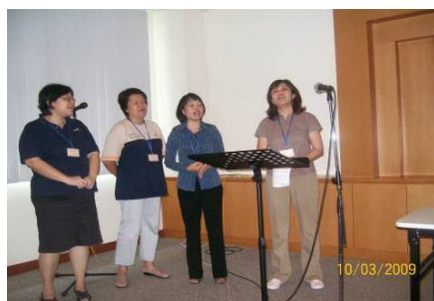
Worship led by Malaysian delegates