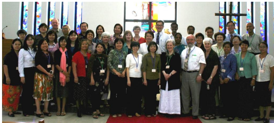
Participants and resource persons of the 5 th consultation, TTC, Singapore

The 5 th ForATL consultation and workshop was held at Trinity Theological College, Singapore, during March 13-15, 2009, under the theme: