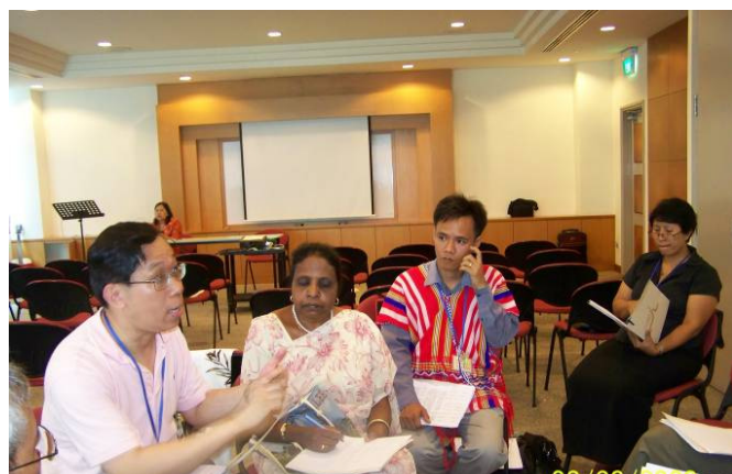
Task Force: Articles from Asian Journals