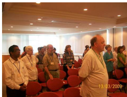
Delegates of the consultation