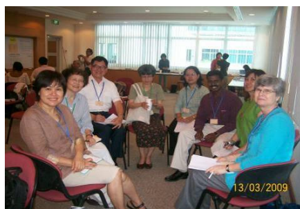
Task Force: Theses and Dissertations